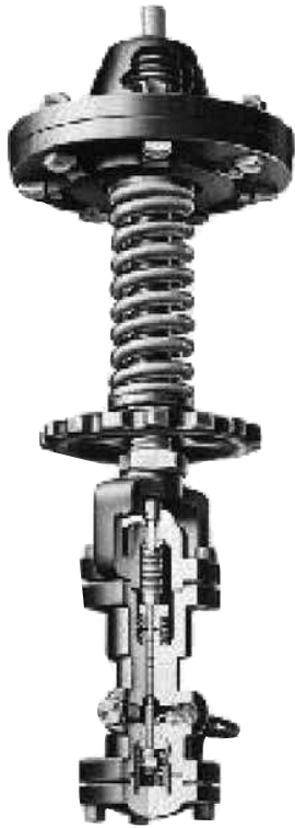
TYPE F46 PILOT