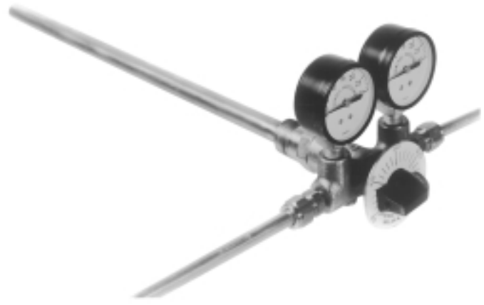
TYPE T61 PNEUMATIC TEMPERATURE CONTROLLER