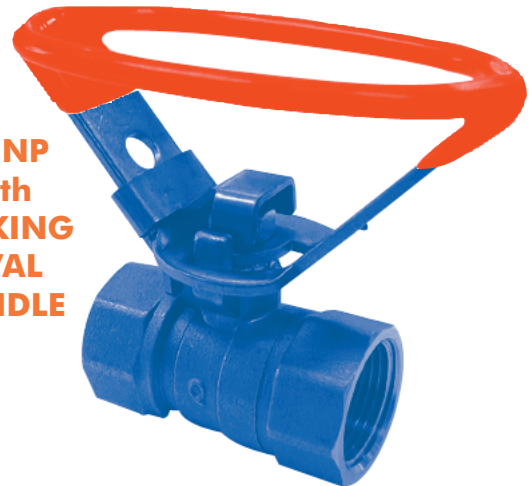
20-NP with LOCKING OVAL HANDLE