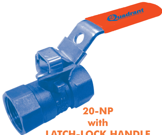
20-NP with LATCH-LOCK HANDLE