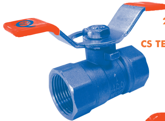
20-NP with CS TEE HANDLE