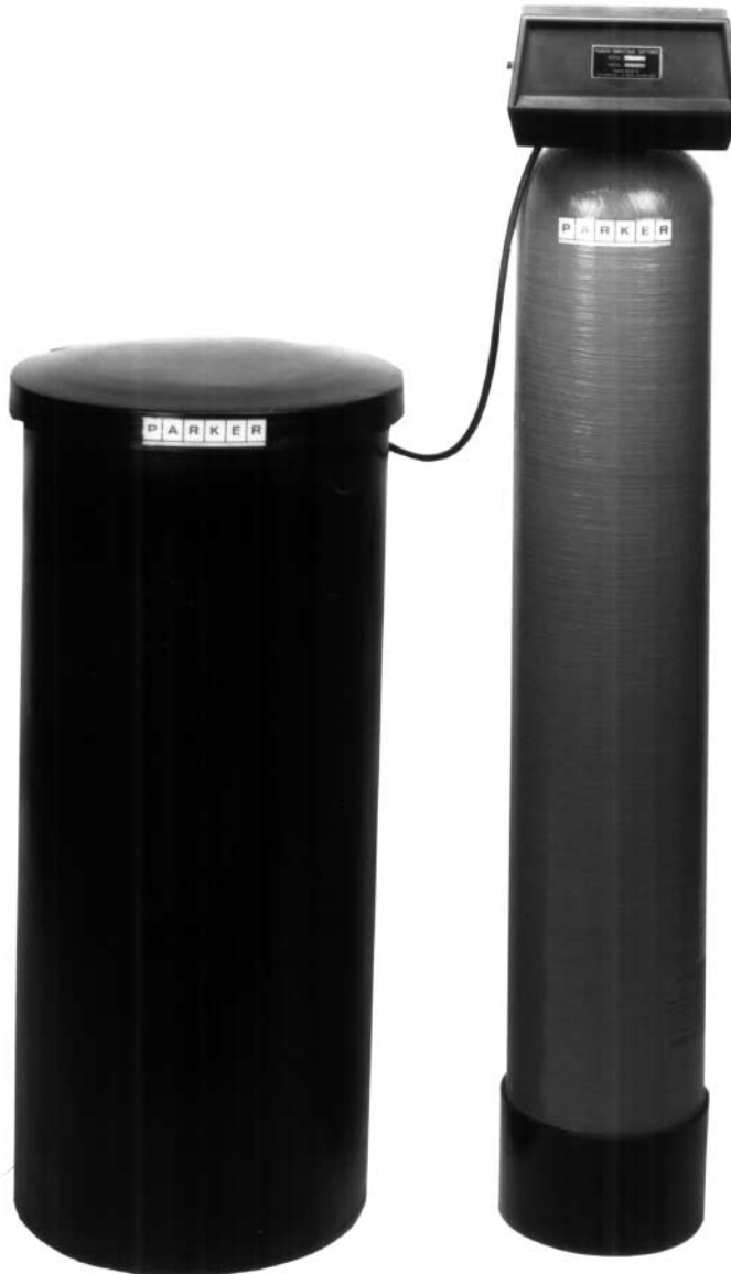
Fiberglass Automatic Water Softener

Be sure of getting only the best Water Softener at low initial cost. The Parker is a rugged, heavy duty Industrial softener, built to provide many years of trouble-free service. The purchase of a Parker Softener assures not only the ultimate in quality but the guarantee of an experienced manufacturer to assure the ultimate in economy of operation and maintenance.