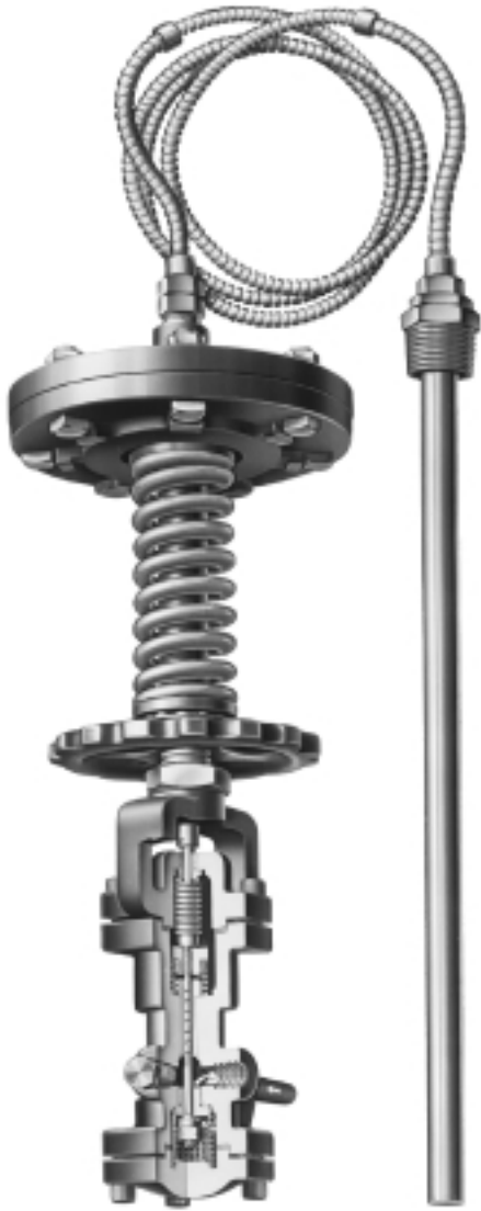
TYPE T52 TEMPERATURE PILOT