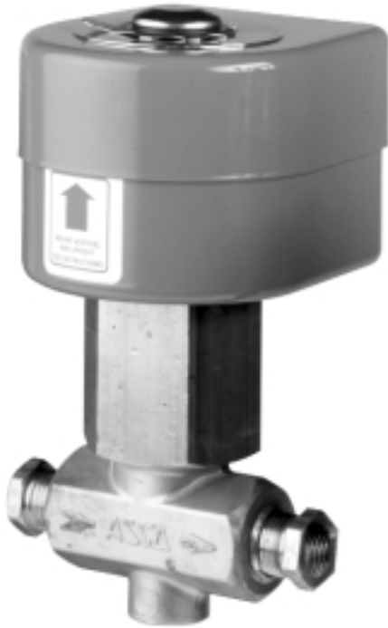
TYPE M SOLENOID PILOT