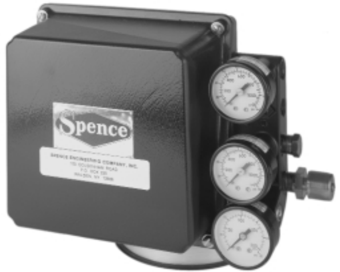
MOORE 760P PNEUMATIC POSITIONER